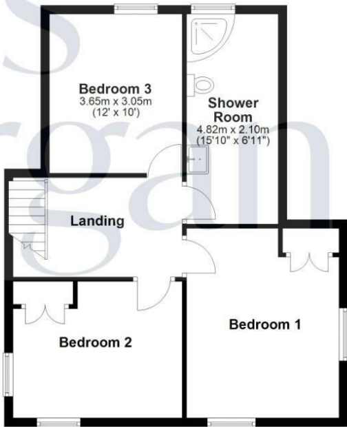
Total area: approx. 142.5 sq. metres (1533.5 sq. feet)